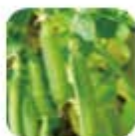
Hydrolyzed Pea Formulated in 1 to 9