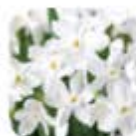
Narcissus Tazetta Bulb Extract Formulated in 1 to 9