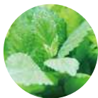
Mentha Rotundifolia Leaf Extract

<Moisturizing, skin conditioning ingredients>