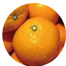
Citrus Iyo Fruit Extract

<Skin tightening, skin conditioning ingredients>