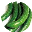
Cucumis Sativus (Cucumber) Fruit Extract