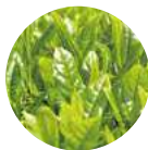
Camellia Sinensis Leaf Extract

<Moisturizing, skin conditioning ingredients>