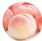
Prunus Persica (Peach) Fruit Extract