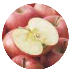
Pyrus Malus (Apple) Fruit Extract

We use our own organic ingredients. Excellent skin moisturizing effect, leading to moisturized skin.