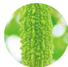
Momordica Charantia Extract