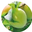
Prunus Mume Seed Extract

<Skin tightening, skin conditioning ingredients>